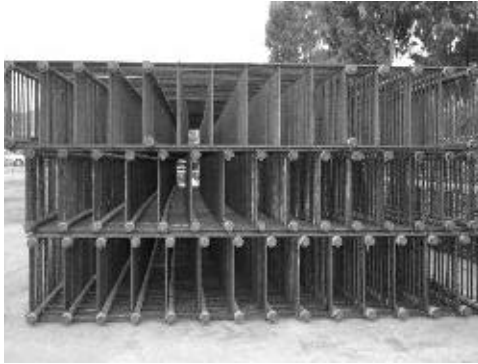
Figure 4 - BauLadders in BauCages for 12-story Hard Rock Hotel Under Construction in San Diego

Another benefit that BauGrid® WRG offers the bridge engineer is the significant reduction in labor and construction time that is well documented by contractors who have built tall buildings in seismic regions. At the 42-story St. Regis project in San Francisco a single piece of BauGrid® WRG called a BauLadder® replaced thirty-two pieces of conventional hoop and cross-tie reinforcement resulting in very significant labor savings to the contractor who used the BauLadder®s to make the BauCages™ used in the shearwalls.