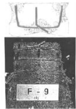
Figure 3 - Failure of conventional hooks in Prof. Sheikh's research

Of great interest to bridge engineers are the results of separate tests performed by Prof. Saatcioglu on specimen of 20,000psi High Performance Concrete (HPC) reinforced with BauGrids® with High Strength Steel (HSS) with yield strengths of 80ksi. 7 The combination of HPC and HSS BauGrid® WRG as confinement reinforcement now gives the bridge engineer a very strong structural element that has excellent inelastic deformability while still being very constructible.